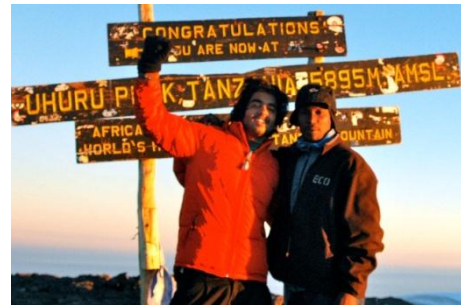
At the top of Mt. Kilimanjaro, Africa's highest peak!

The community of Manenberg has a tremendous education problem that has expanded beyond the transformation capabilities of the community organizing that is currently underway. My project was to continue engaging with the community of Manenberg, and I did so by teaching 7th grade at Manenberg Primary. Teaching 7th grade in Manenberg has been a challenge due to the wide range of academic levels, from students who understand the literacy curriculum to those who simply cannot read. As the learners in grade seven graduate from Manenberg primary and enter into high school, they tend to be recruited by junior gangs, and are encouraged to drop of school. This continues the cycle of violence in the communities. Literacy development has the power to change the future of Manenberg, because literacy has intangible and multifaceted benefits in addition to achieving in school. The program I have been teaching in incorporates themes of self-empowerment, and struggle, which is relevant to the community.