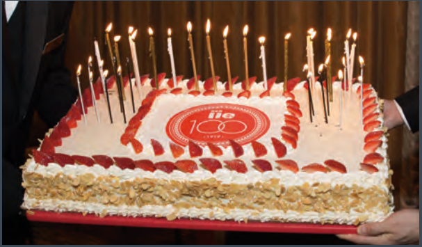
IIE CENTENNIAL GALA ABOVE: Attendees at the Centennial Gala celebrating IIE's 100 years of transforming lives.