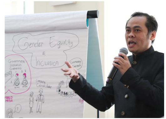
PRESTASI-III scholar presenting on gender equity and inclusion

Egyptian alumnae learned how to be self-reliant and financially independent, which has been instrumental in helping them plan for their future. They feel more empowered as women and have made a point to empower other women in their communities. 50% of scholars interviewed also reported that families of alumnae are more open to the idea of women pursuing opportunities outside of cultural norms, e.g., women travelling and living alone