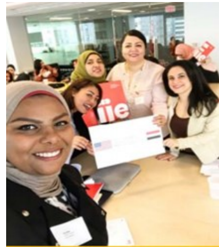
2018 MBA Re-entry Workshop

USAID scholarship alumnae share resources, help others seek similar scholarship opportunities, and volunteer in their communities.